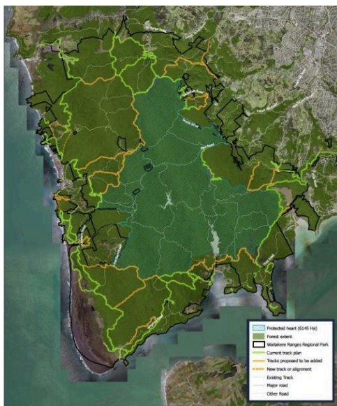
Figure 1: Proposed Heart of the Ngahere Sanctuary

Te Kawerau ā Maki is proposing a ‘heart of the ngahere’ sanctuary be created within the Waitakere Ranges Regional Park. In their proposal it states “A pest-free sanctuary at the heart of the forest would provide a reservoir of life and mauri that support biodiversity, a stable climate and water security – if the heart thrives it will enable biodiversity to ‘spill over’ into the more compromised edges of the forest.” The proposal also includes a track plan for the park which would see more tracks reopened but would not include tracks in the interior of the park. It also proposes “a new multi-day Waitakere Ranges circumference hike across regional and local tracks and greenways.”